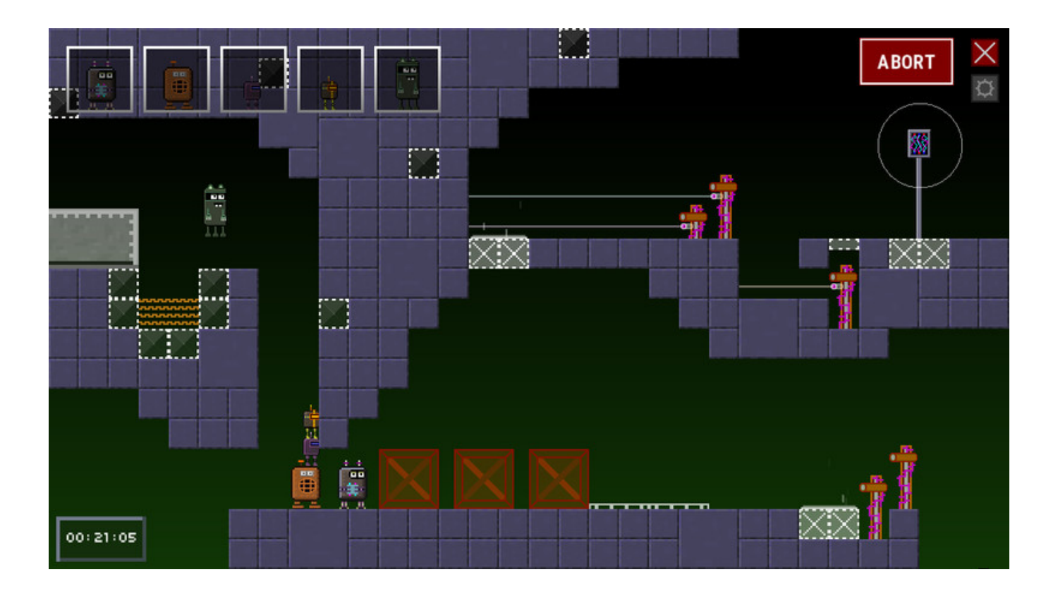
Land Of An Endless Journey Activation Code [Ativador]

Download >>> <a href="http://bit.ly/2Jo5AtS">http://bit.ly/2Jo5AtS</a>